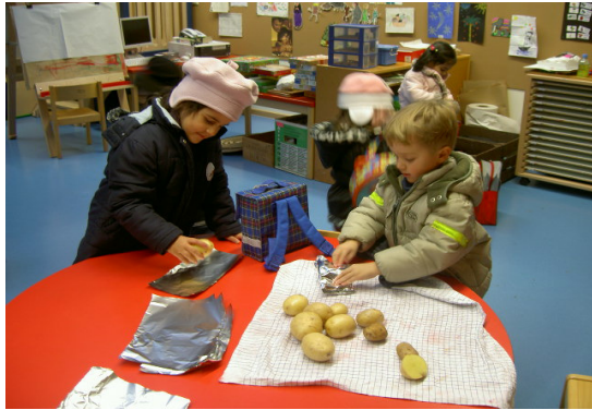
Preparation in school.