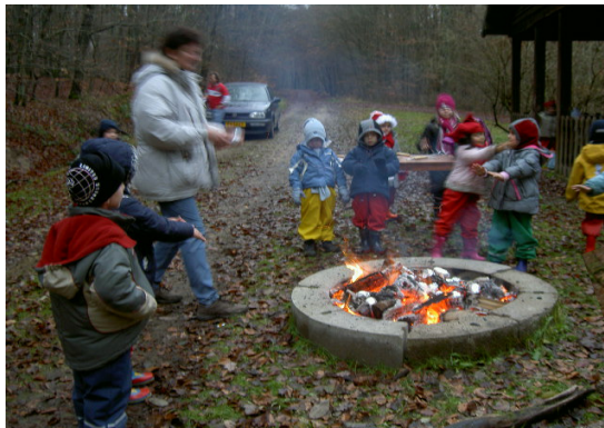
The potatoes in the fire!